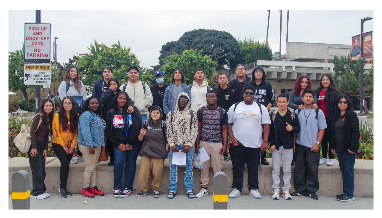
Hawthorne High school students at South Bay Workforce Investment Board's 25<sup>th</sup> Annual Blueprint for Workplace Success Youth & Young Adult Job Fair at El Camino College.

Lawndale High school students at South Bay Workforce Investment Board's 25<sup>th</sup> Annual Blueprint for Workplace Success Youth & Young Adult Job Fair at El Camino College.