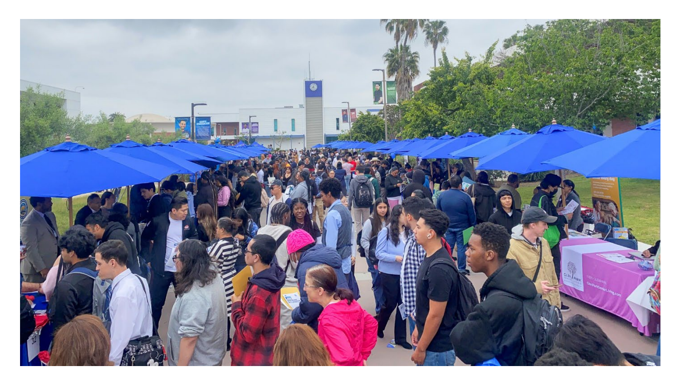
Photo caption: Over 1,400 high school and college-age students gathered at El Camino College for the 25th Annual Blueprint for Workplace Success Youth & Young Adult Job Fair presented by the South Bay Workforce Investment Board on Wednesday, April 30<sup>th</sup>, 2025.