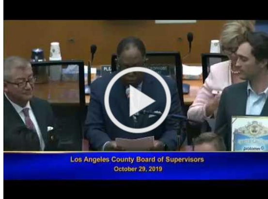
LA County Board of Supervisors recognize 39 SBWIB Bio-Flex Pre-Apprenticeship Graduates