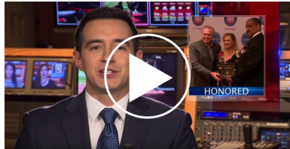
24th Annual Awards Ceremony - Hawthorne Community Television Coverage

More than 450 community leaders, educators, employers, training partners and successful job seekers joined with the South Bay Workforce Investment Board staff and administrators for the 24th Annual Awards Ceremony and Banquet, October 10th, at the Torrance Marriott.