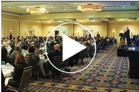
24th Annual Awards Ceremony - Torrance CitiCABLE Coverage