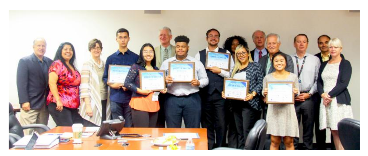
The SBWIB Presents Aero-flex Pre-Apprentice with Certificate of Completion