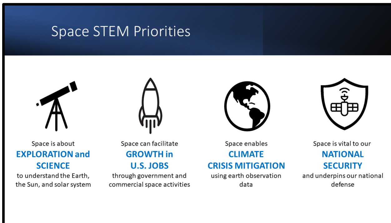
Figure 1. Space STEM Cross-Cutting Priorities include four areas that represent space-focused priorities to inspire, prepare, and employ the current and future space workforce