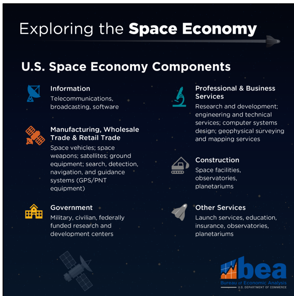
Figure 2. United States Space Economy Components as articulated by the Bureau of Economic Analysis Space Economy Report 8

a gross output of $195 billion in 2019. 6 7 Though astronauts may be the most well-known space workers, this vast space workforce includes thousands of scientists, engineers, and technicians who are equally essential. They contribute a variety of skills and expertise to research, design, build, implement, and evaluate technology and systems that are critical to U.S. space activities. In addition, there are space workers employed in occupations that include a broad range of disciplines, degree-levels, work-related credentials, and skills that may not be typically represented as “space STEM” careers. Our Nation’s future work in space is reliant on the ability to build a diverse, skilled STEM workforce that is trained and equipped to advance efforts to enable innovation, exploration, and discovery. The appendix includes a snapshot of some skilled technical occupations for which a high school diploma or equivalent, associate degree, or postsecondary nondegree award are the typical credentials of new entrants. Future work will include ongoing engagement with the space ecosystem and an in-depth analysis of the current and future space workforce needs.