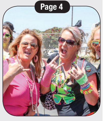
Like Totally festival in Huntington Beach canceled by organizers