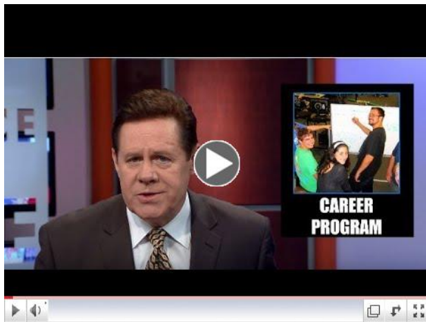
Aero-Flex Pre-Apprenticeship Program Coverage Torrance CitiCABLE

Follow the link below to learn about the Aero-Flex Pre-Apprenticeship training model, how to qualify and more.