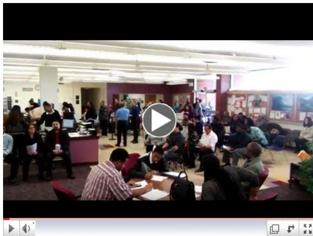
SBWIB Veteran Services - $500k Veteran Grant Coverage - Torrance CitiCABLE