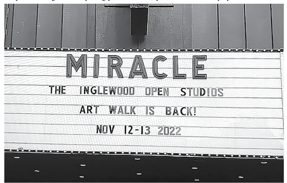
The Art Walk is Back.

Well, the bottom line is Inglewood is a great community. Both the City and the Inglewood Art Walk are proud, and rightfully so. Did I say the excitement is palpable? •