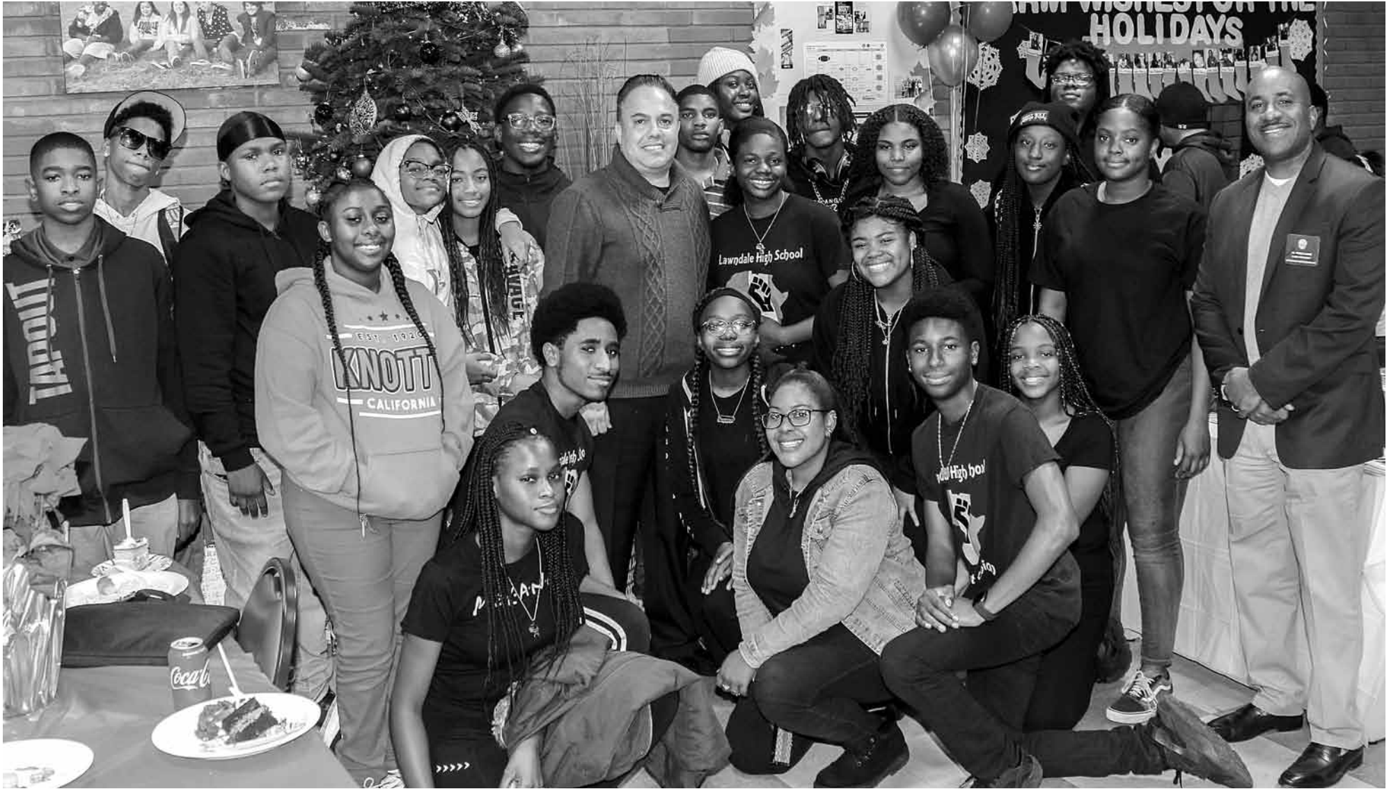
South Bay Workforce Investment Board and partners host the Hawthorne Teen Center's 11th Anniversary on Thursday, December 5th, 2019 at the Hawthorne Memorial Center.